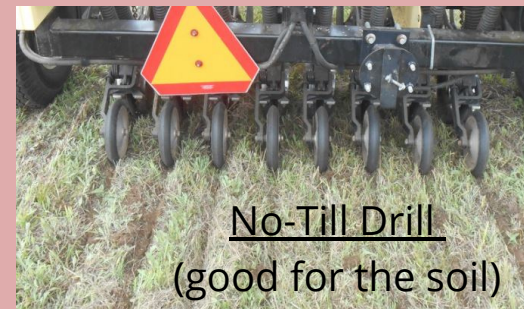
No-Till Drill (good for the soil)

LEARNING RESOURCES FOR ALL TOPICS CAN BE FOUND AT THE VA SWCD ASSOCIATIONS WEB SITE